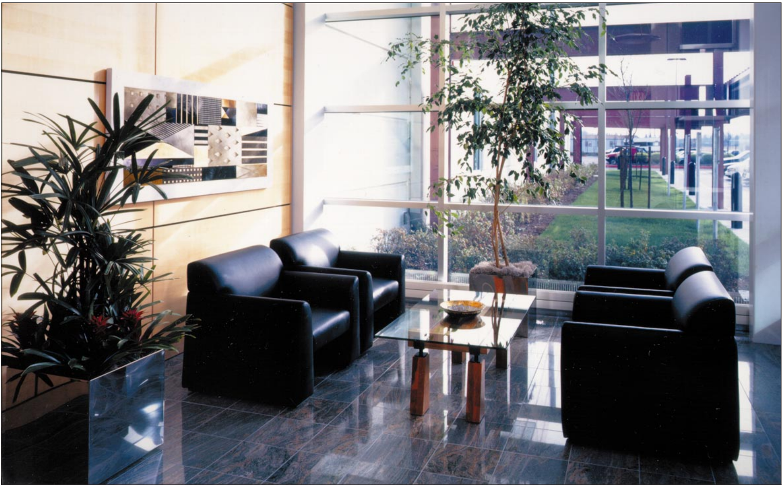
SUMCO USA (formerly Mitsubishi Silicon), Salem Campus Lobby Interiors Sundeleaf's interior design, which included custom casework, expresses the division's advanced technology nature. We also supported space planning and coordinated the move.