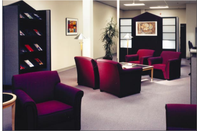
Moving is an opportunity to implement corporate design initiatives. The style of the resource library of this Washington-based company reflects the compatible interior design and space planning we performed at both its campuses.

Processes allow a company to set standardized rules around furniture systems and layout, budgets, and work areas. They remove the personal aspect of individual decisions regarding whose office is situated where or what type of furniture they get. With consistency in fur-