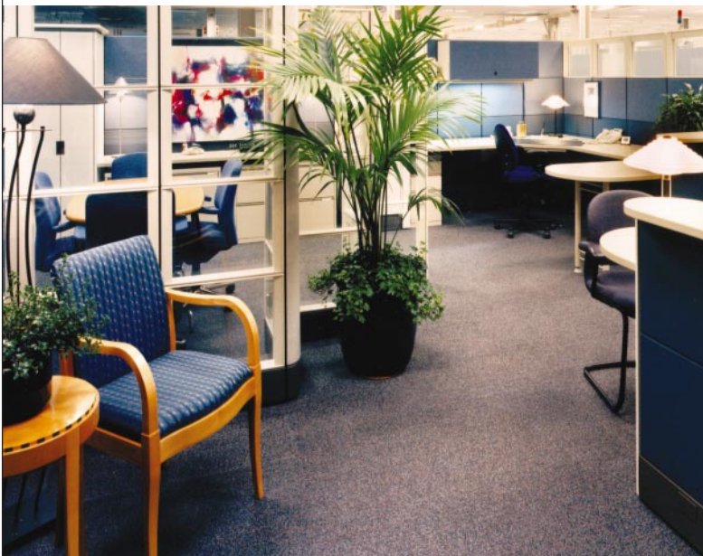
Unique office layout solutions. For continually changing organizations, space planning must accommodate adjacency issues for departments which are frequently reconfigured, for project teams, and mobility workers.